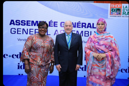
Minister of Public Service of Ivory Coast, Anne Désirée Ouloto, President Andrés Pastrana, and Minister of Social Affairs of Mauritania, Naha Mint Mouknass.

On the statutory front, the minutes of the previous General Assembly (Marrakech, 13 April 2024) were approved unanimously. The President then presented the proposed resolutions for endorsement by the Assembly , as instruments of political expression and affirmation of IDC-CDI values.