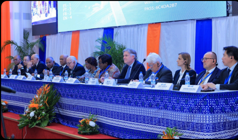
Members of the Executive Committee preside over the General Assembly meeting.

The session was plenary and political-institutional in character, marked by the host party's message and a focus on democratic stability. The President of the Senate conveyed the greeting " Akwaba " and reaffirmed the commitment with democracy, human rights, and well-being, with special mention of men, women, and young people.