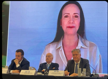
Video message of support from the leader of the democratic transition and Vice President of the Bolivarian Republic of Venezuela, María Corina Machado.