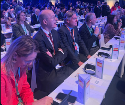
Our Secretary General, Antonio López-Istúriz, attending the EPP Congress.

Valencia hosted, last April, one of Europe's most influential political gatherings: the Congress of the European People's Party (EPP) a space where the institutional agenda and the moral compass of democratic centrism intersect in an increasingly demanding context. Our presence is doubly justified: events of this kind carry obvious strategic value, as they not only address European priorities — which are relevant to the International — but also consolidate alliances, share diagnoses, and reinforce a message that must be repeated through actions today: moderation can lead and govern . Furthermore, it is our strategic priority to strengthen our permanent commitment to this institution, which has been a member of our centrist family for decades and with which we share some ten affiliated parties. The occasion allowed us to witness the renewal of the party's leadership, with the appointment of prominent members to its presidency and secretariat, as well as ten vice-presidents.