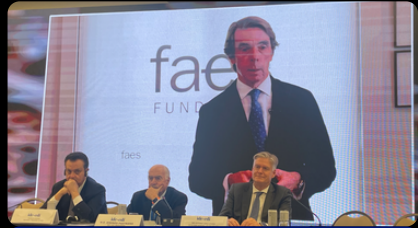
Video message of support from the former Prime Minister of Spain and former President of the Centrist Democrat International, José María Aznar.