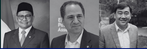
Muhaimin Iskandar PKB - Indonesia