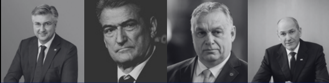
Andrej Plenković HDZ - Croatia