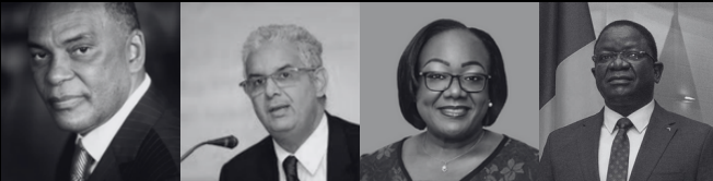
Adalberto Costa Jr. UNITA - Angola