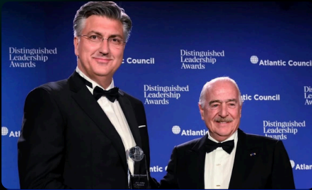
Andrej Plenković and Andrés Pastrana

In 2025, the IDC-CDI reinforced its transatlantic projection in one of the most influential areas for strategic debate in Washington: The Atlantic Council . In the context of its Distinguished Leadership Awards , President Andrés Pastrana participated in an event that, beyond institutional recognition, symbolizes a central idea for our political family: democracy needs solid alliances, steady leadership, and tangible results to remain credible in the eyes of citizens.